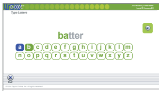
Letters of Sounds